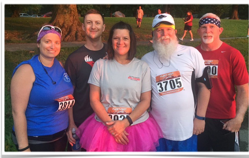
The NATA Foundation 5K Fueled by Gatorade - Baltimore, MD - June 25, 2016

Corvallis High School - Corvallis, OR Lebanon High School - Lebanon, OR Redmond High School - Redmond, OR South Salem High School - Salem, OR Sprague High School - Salem, OR Auburn Mountainview High School - Auburn, WA Eastmont High School - East Wenatchee, WA Wenatchee High School - Wenatchee, WA Boise High School - Boise, ID Borah High School - Boise, ID Capital High School - Boise, ID Centennial High School - Boise, ID Skyview High School - Nampa, ID Timberline High School - Boise, ID Beaverhead County High School - Dillon, MT Billings West High School - Billings, MT Hellgate High School - Missoula, MT Loyola Sacred Heart High School - Missoula, MT